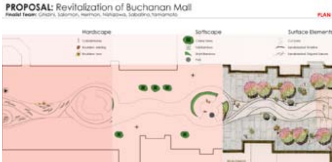
Plan view of PROPOSAL: Revitalization of Buchanan Mall A design proposal for a public art project. This illustrates some aspects of the plaza, which would have been redesigned, including a walkway, lighting fixtures and central seating area.