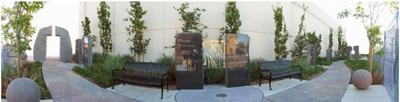
Ohlone Memorialization Project Emeryville, CA , 2004

In a new development on Bay Street, a space was reserved and a park created to commemorate Ohlone culture. A large granite entryway with a map of the area carved into it, with small red tiles indicate the locations of all the various shellmounds enframe both ends of the park. Ten granite forms with an Ohlone culture timeline in text and image, line a path through the park. The granite forms are connected by a glass panel that has been etched with a drawing of some aspect of Ohlone culture.