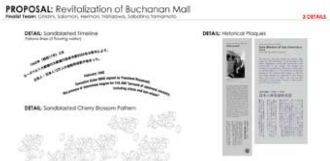
Detail view of PROPOSAL: Revitalization of Buchanan Mall